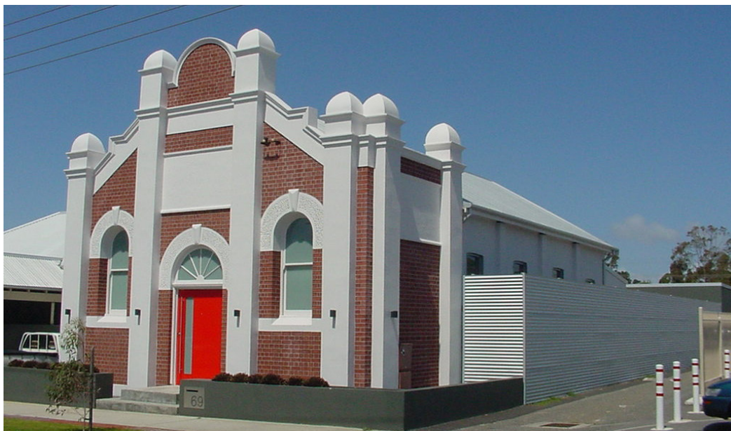
Former Salvation Army Citadel, 69 Barlee Street, Mount Lawley - Aesthetic and Historic Significance