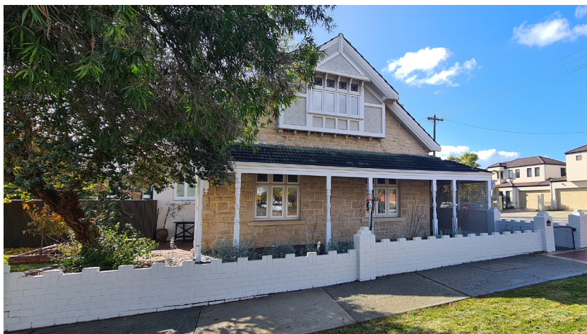
Lochindorb, 166 Lincoln Street, Highgate - Management Category 2