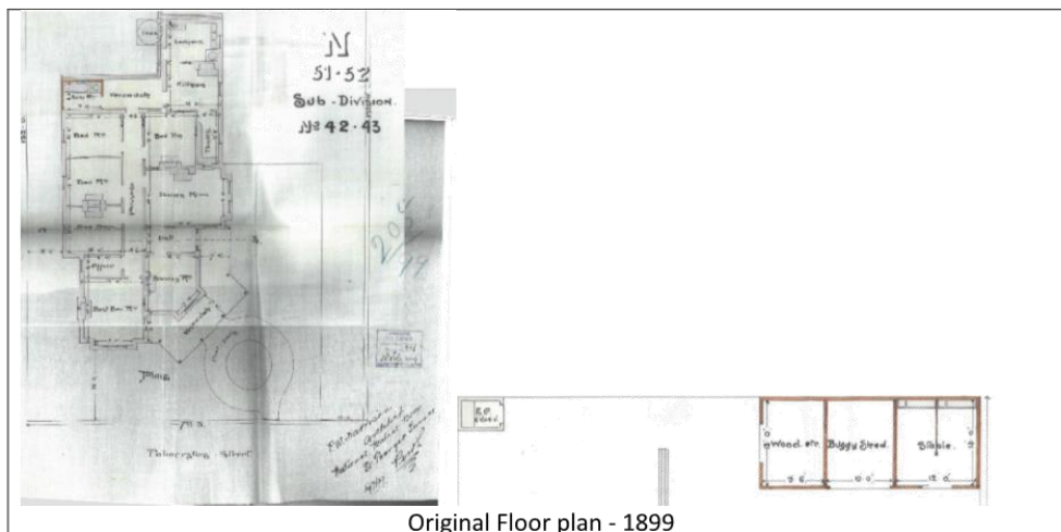
Original Floor plan - 1899