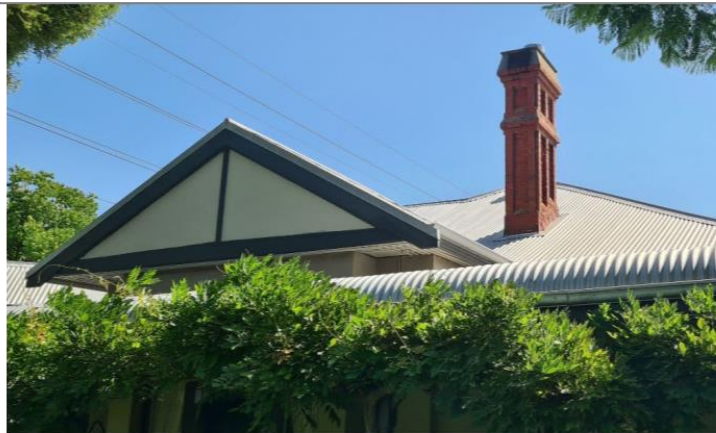
Gable and chimney to southern elevation