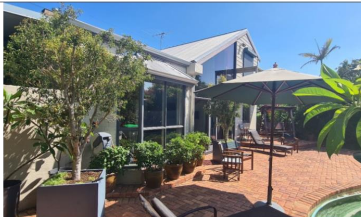
Rear two storey extension to eastern elevation