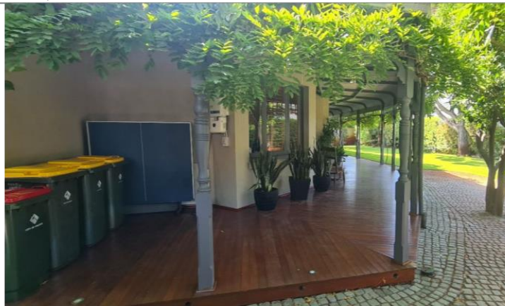
Return verandah to south west corner