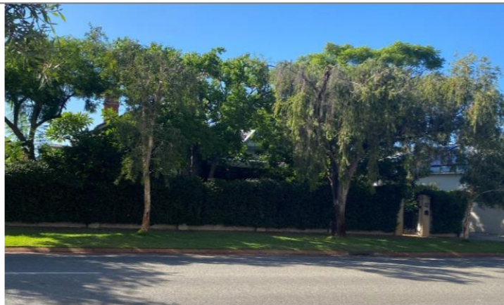
External view of western elevation from Palmerston Street