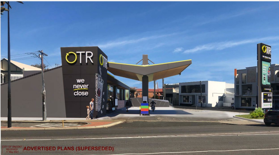
CITY OF VINCENT RECEIVED 17 May 2021 ADVERTISED PLANS (SUPERSEDED)