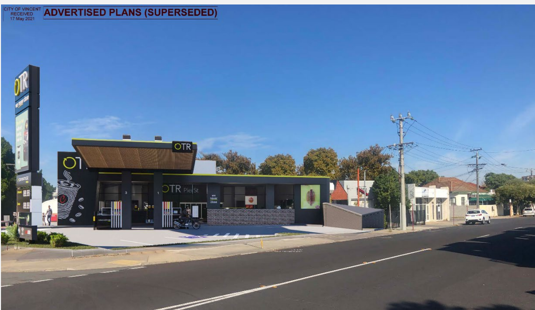
CITY OF VINCENT RECEIVED 17 May 2021 ADVERTISED PLANS (SUPERSEDED)